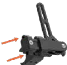
2 cable outlets