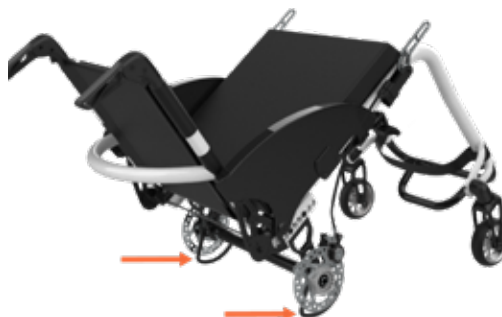
The safety guard prevents the rotor from touching the ground.