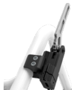
The brake handle is assembled to the chair frame by using clamps as shown above.